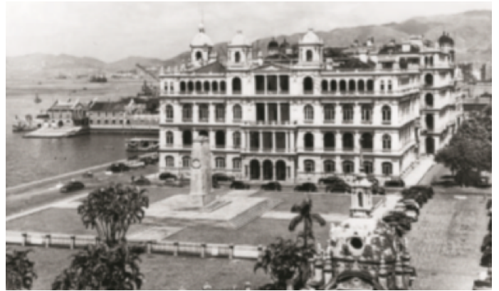
The VRC can be seen to the left of the Hong Kong Club building, behind the cenotaph.