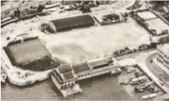
An aerial shot of the Club.

Many Members may be unaware of the full history and importance of the VRC. Originally situated in Victoria Harbour, close to the Hong Kong Club and the cenotaph, the VRC boasted extraordinary facilities for the time, which also included a swimming pool and a sailing and rowing base.